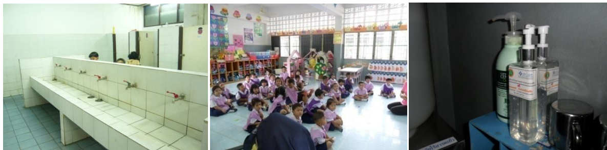
Figure 3. Environmental survey in 4 schools of Districts X and Y, Nakhon Ratchasima Province, Thailand, 2011

provided with alcohol gel instead of soap (Figure 3).